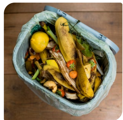
Our policies aim to reduce and prevent food waste