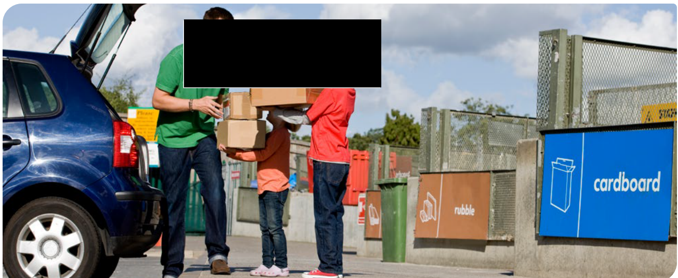
Family recycling cardboard at recycling centre